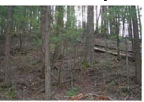
Before and after photo